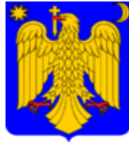
Wallachia Coat of Arms

In December 1447 Hunyadi again with Hungarian, Boyar and rival faction support defeated Dracul and his son Mircea II. They killed Dracul. They blinded and buried Mircea II alive. During this conflict Dracula, an Ottoman slave, was put in a prison and severely beaten. He had a view of Ottoman executions including impalement.