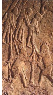
Hebrew impalement by Neo-Assyrians

As a student taught by biblical scholars along with his personal experiences Dracula understood that impalement was an acceptable punishment. Archeology and the Bible have shown impalement is long existent. During recent history the death penalty for Anti-Semitism became legal in Russian Jewish Communism and impalement is still used in some form by Islam as an acceptable form of punishment.