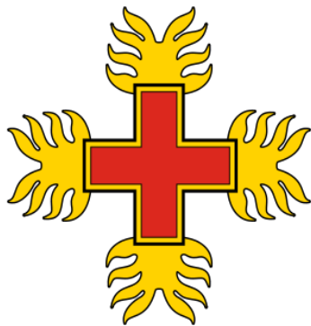
Hungary: Ordo Draconum

Hungarian King Sigismund called on Dracula's father. Twenty-four kings and princes were to attack the Ottomans who just conquered Serbia and Bulgaria. King Sigismund put them in the Hungarian Order of the Dragon , an Order established by the Pope against the Ottoman's. Basarab was given Transylvania but wanted Wallachia then ruled by an opposing clan. Basarab now called himself Dracul meaning Dragon. Dracula was born and named Vlad.