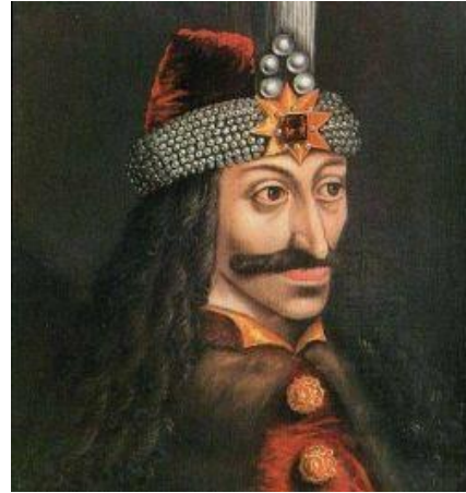
Vlad Tepes - Dracula - Little Dragon

Dracula was truly vicious against Ottoman combatants, especially the Janissary cavalry he was trained into and his brother Radu (The Beautiful) belonged. In one campaign he killed more than 23,000 Turks. Many survivors were impaled by roadsides and left as a warning. Once Mehmed II mounted a campaign and Dracula had 20,000 Ottomans impaled where the Ottoman's were advancing. Mehmed II retreated. Both Dracula and Mehmed II applied brutal psychological warfare.